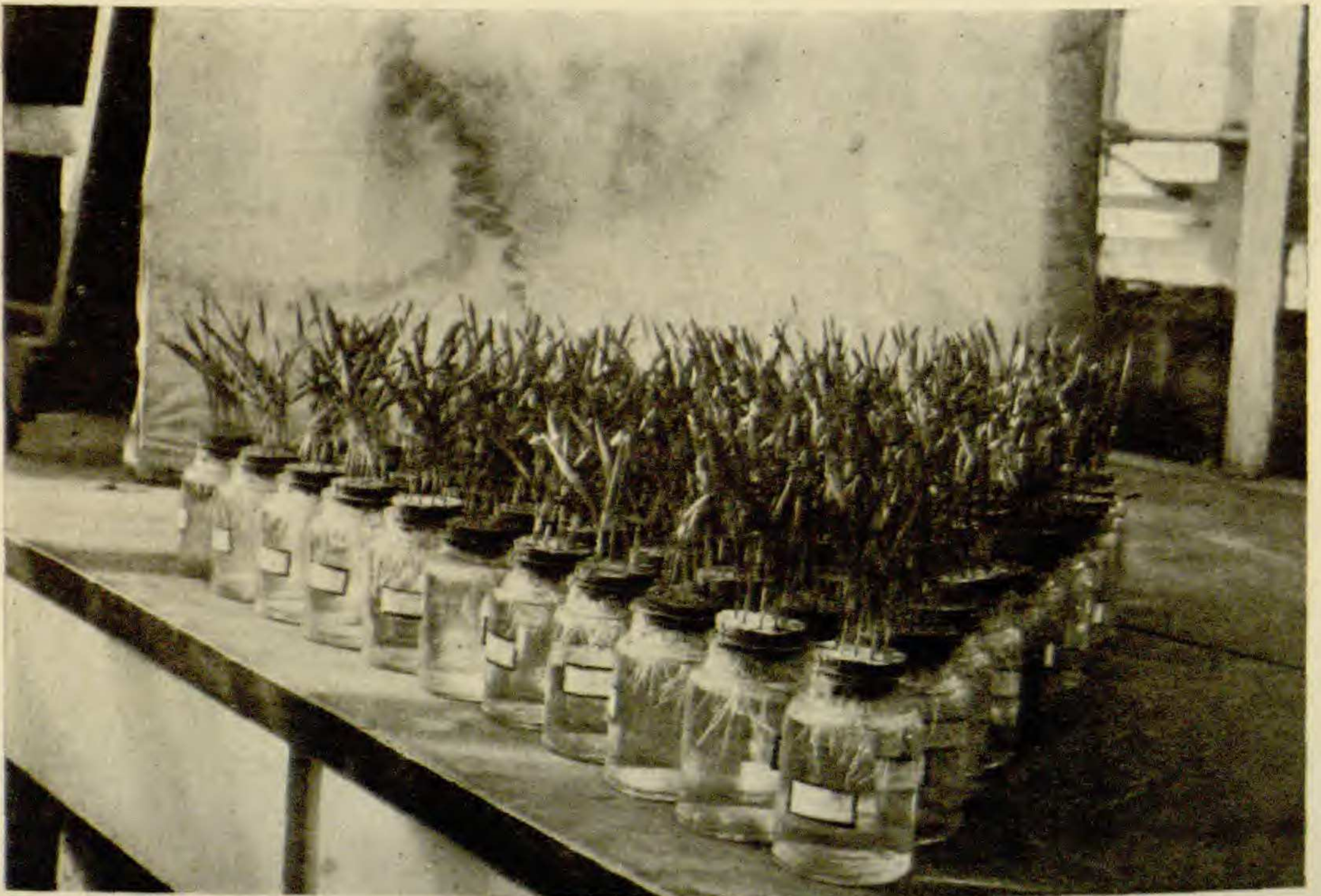
FIG. 2.—Wheat plants growing in nutrient solutions with 50 ppm. of methyl glycoll.